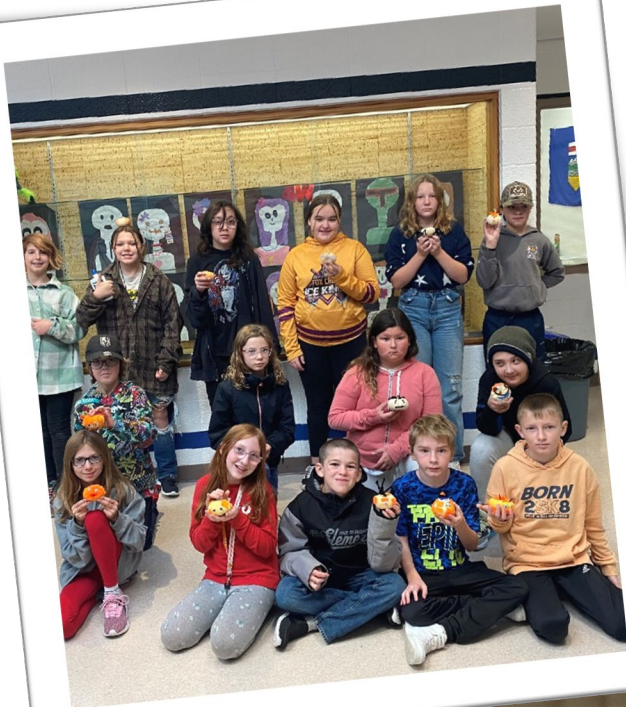
Grade 6 with their mini pumpkins