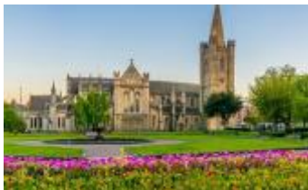
St. Patrick's Cathedral