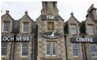
Loch Ness Centre